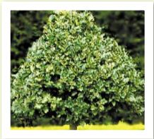
HOLLY ( Ilex Aquifolium )

Amongst the Bach-Flower Essences there is one, which is especially connected with the upcoming holidays: it is Holly. The beautiful tree inhabits the energy of all-encompassing love. With a name nearly a homophone of holy, this is no coincidence as many cultures connect Holly to the principle of divine love and protection. That's why we often find the branches as part of the Christmas decorations.